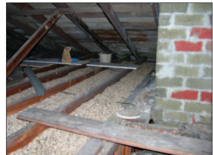
Asbestos-containing vermiculite attic insulation

For information on asbestos in houses, go to WorkSafeBC.com and search for asbestos .