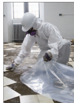
Protected worker removing asbestos flooring