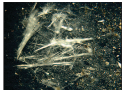
Asbestos fibres in vermiculite attic insulation